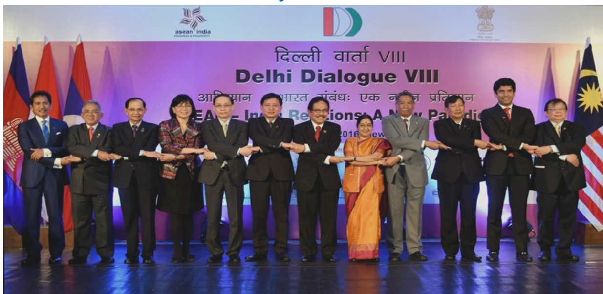
Smt. Sushma Swaraj, Hon'ble External Affairs Minister, Government of India with other dignitaries of ASEAN countries at the Delhi Dialogue-VIII.

Smt. Sushma Swaraj, Hon'ble External Affairs Minister, Government of India inaugurated the three-day Delhi Dialogue VIII on 17-19 February 2016 at New Delhi, on the theme "ASEAN-India Relations: A New Paradigm". The Dialogue was organised by the Ministry of External Affairs (MEA), in partnership with the Institute for Defense Studies and Analyses (IDSA); ASEAN-India Centre (AIC) at RIS; the Federation of Indian Chambers of Commerce and Industry (FICCI); Confederation of Indian Industry (CII); All India Association of Industries (AIAI); Indian