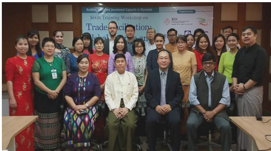
Group Photo, Sixth Training Workshop on Trade Facilitation, Yangon, Myanmar

and procedures: Business Process Analysis (BPA)' and 'Measuring trade facilitation performance: Trade and transport facilitation monitoring