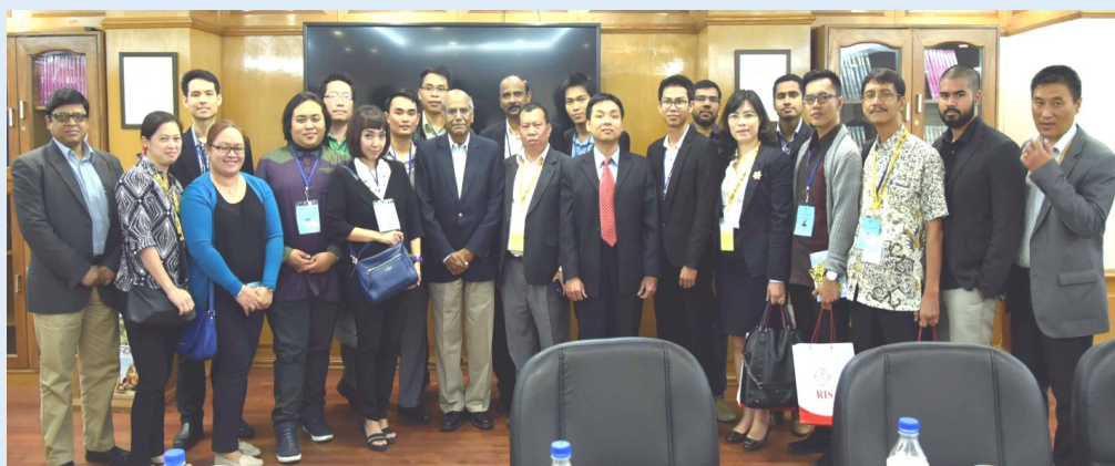
Group Photo, ASEAN Journalists with Amb. Shyam Saran