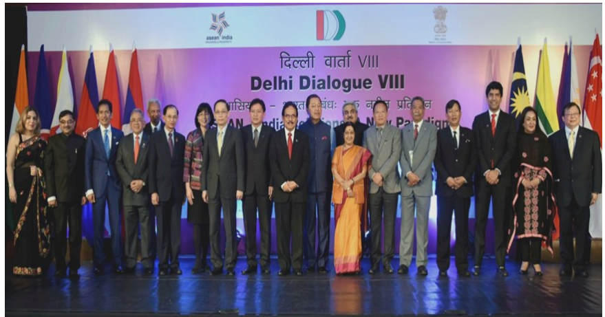
Group Photo, Delhi Dialogue VIII, 18 February 2016, New Delhi.

AIC at RIS organised the session on 'Reinvigorating the Civilizational Links' that deliberated on issues like ASEAN and India historical and cultural links, tracing cultural routes, preserving historical and archaeological valuable things and maintaining cultural heritage.