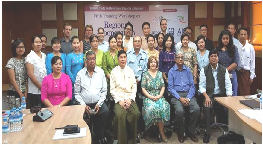
Group Photo, Fifth Training Workshop on Regional Cooperation and Integration, Yangon,